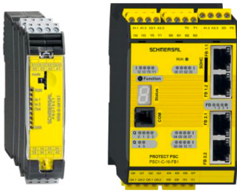
Figure 1: A safety PLC can be used for system failure detection