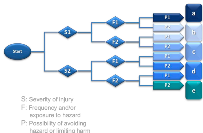
Figure 4: A decision tree for assessing functional safety of engineering controls

Engineering controls are frequently applied to safeguard hazards. With the introduction of a safety function through engineering controls, the performance level of the control must be determined. ISO 13849 provides a decision tree for assessing functional safety based off severity of injury, frequency of exposure, and possibility of avoiding the hazard.